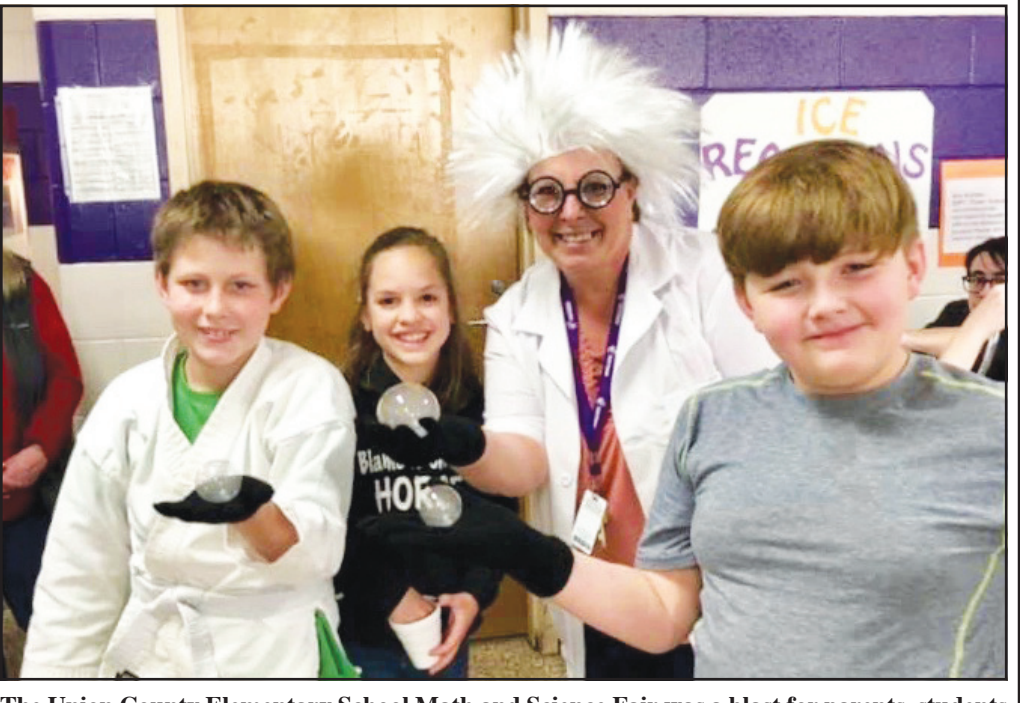
The Union County Elementary School Math and Science Fair was a blast for parents, students and teachers alike on Tuesday, March 26.